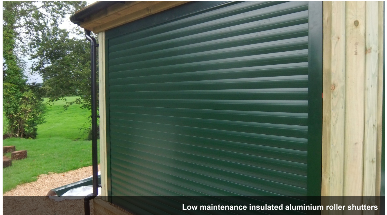
Low maintenance insulated aluminium roller shutters